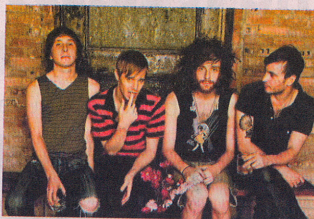
Let's hear it for the boys: Bear Hands open up this year's Siren Fest.

Sunday through Oct. 5, MoMA, 11 W. 53rd St., $20 From 1960-1976, Amsterdam was a haven for artists (not just stoners) such as Hanne Darboven, Gilbert & George, Sol